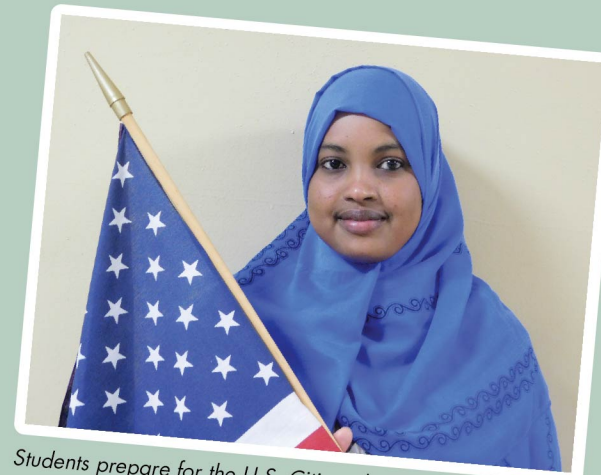
Students prepare for the U.S. Citizenship exam.