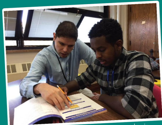
Students prepare to pass the ParaPro exam and gain employment as paraprofessionals in local school districts.

Assuring learning excellence and readiness for a changing world.