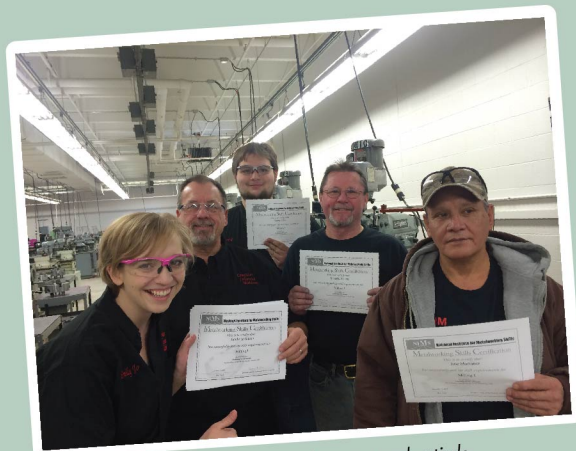
Students enroll in college and earn credentials.