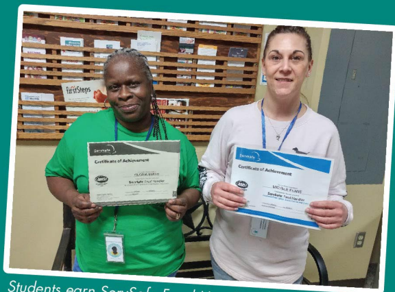
Students earn ServSafe Food Handler and Food Manager certifications for work.