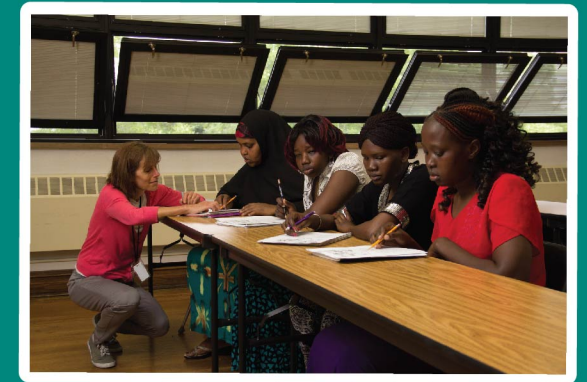
Adults can build lasting friendships as they learn English.

English classes are divided into ability levels and focus on listening, speaking, reading, writing and vocabulary development. Daytime and evening classes are available.