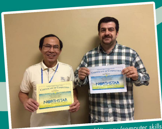
Students earn Northstar Digital Literacy (computer skills) certificates.