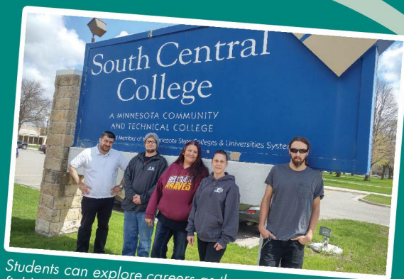
Students can explore careers as they participate in field trips to colleges and local businesses.