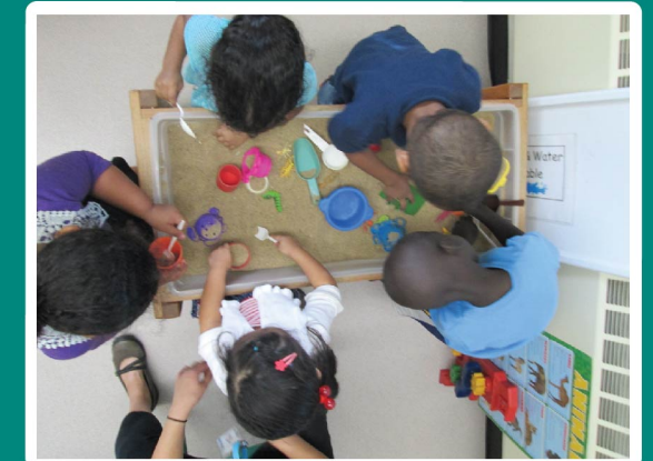
Lincoln Logs Learning Center helps prepare children for school.

English classes are divided into ability levels and focus on listening, speaking, reading, writing and vocabulary development. Daytime and evening classes are available.